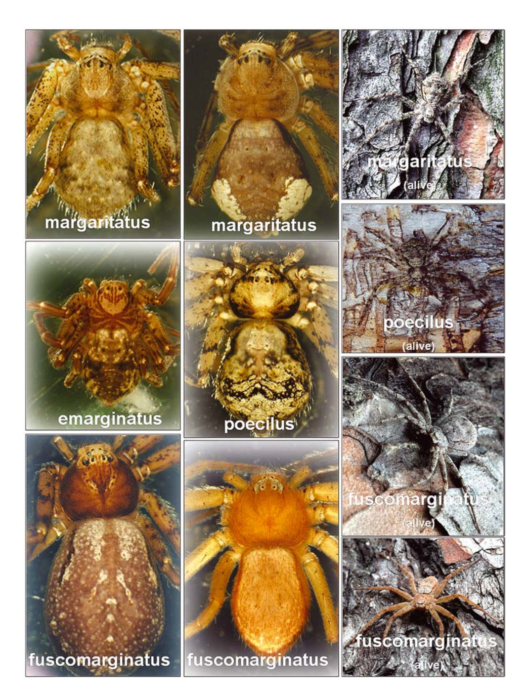
Fig. 3. General appearance of Philodromus species, part II. Relative size ratios are relative only to specimens stored in ethanol.