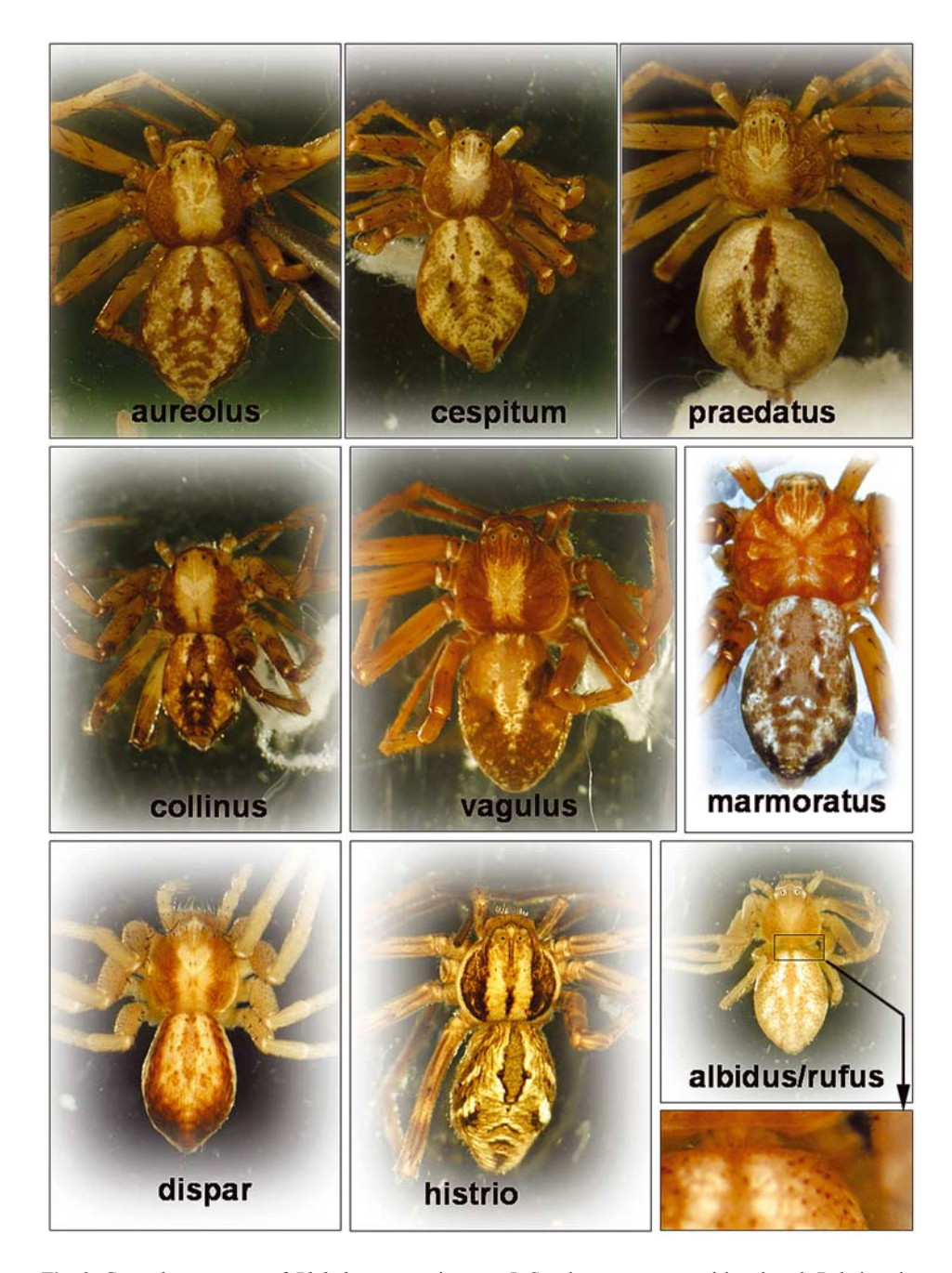
Fig. 2. General appearance of Philodromus species, part I. Specimens were stored in ethanol. Relative size ratios are proportional among individual species and also between Figs 2 and 3.